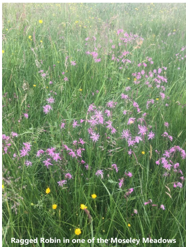
Ragged Robin in one of the Moseley Meadows

We have hosted several hundred visitors over the summer with Open Farm Sunday, school and college visits as well as other farmers and different wildlife groups. Apart from the cows milking, the Hereford herd, the hatching chicks and all the other farm 'stuff' one of the things of interest appeared to be the 'Wild flower Meadows'. We are fortunate to farm 6 or 7 fields that have a profusion of different flowers- creating quite a sight before they are mown for hay or grazed by cattle. One of them has been chosen as one of the Prince of Wales 'Coronation' Meadows (he has encouraged at least one of these in every county in the UK) and we will set about enhancing it with seed taken from a local source to increase the diversity. This will hopefully, help to reverse the 97% loss of meadows over the last 70 years.